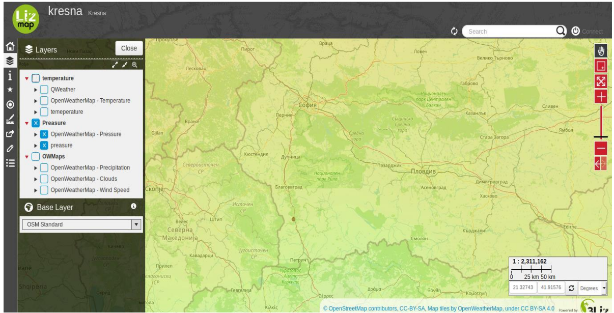
Fig. 3 Main screen and layers list

The application has different zoom features as zoom by rectangle, zoom in and zoom out buttons, and zoom slider. Measure and distance feature can be used to measure the distances and also can measure the size of the focused area. There is a Geolocation feature, Google search bar, and admin panel connection.