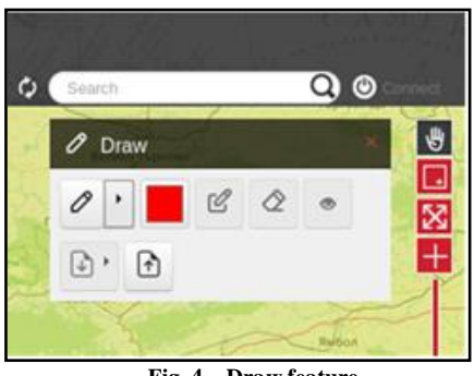
Fig. 4 Draw feature

Draw feature (Fig.4) can be used by the users to draw in the application with different tools as box, point, line, polygon and etc. They can choose from different colors. Edit, erase, and hide the newly created layer and also export it into GeoJSON, GPX, and KML file format, and importing of KML and JSON files is included too.